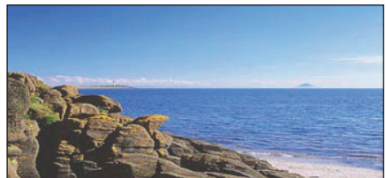
View towards Ailsa Craig